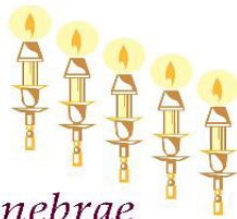
Celtic Tenebrae Service

This beautiful candlelight "service of shadows" includes music by our Chapel Chorale and Celtic